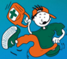
Complete the Injury Minimisation Programme for Schools