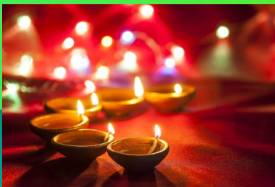
Learn about religious festivals