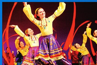
Learn about different cultures through a range of experiences