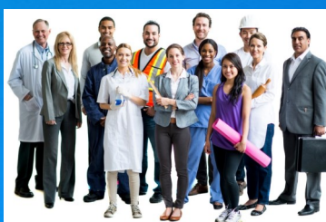
Consider different careers