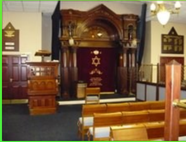
Visit a Synagogue