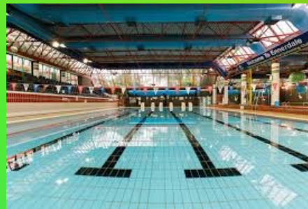
Have swimming lessons