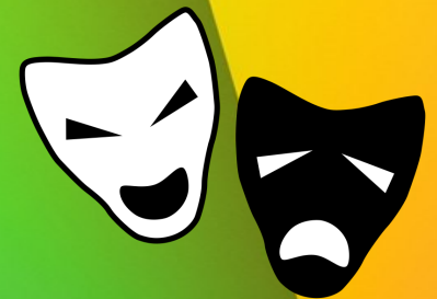
Watch and take part in performances