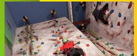
Go on a residential