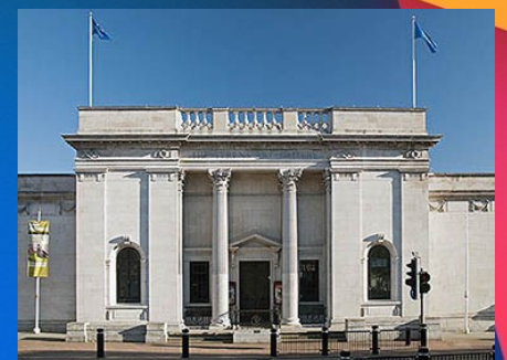
Deepen my understanding of literature, art and technology including a trip to Ferens Art Gallery