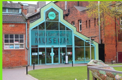
Explore museums in Hull