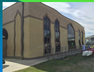
Visit a mosque