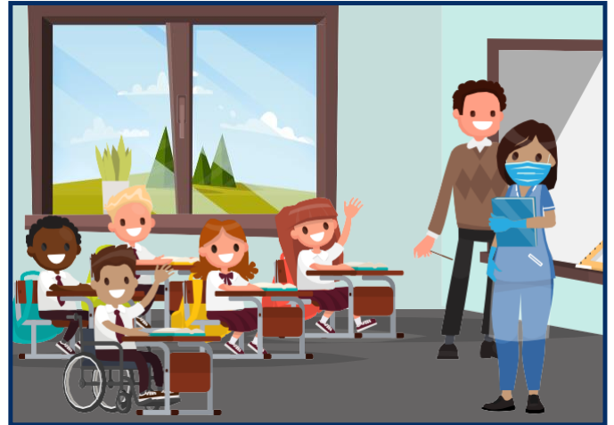
I go to see the nurse and she says hello. She is wearing a mask and gloves to make sure I'm safe from any germs.