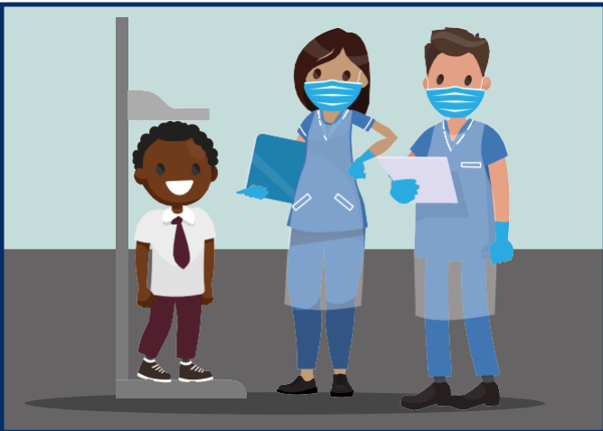
The nurse asks me to stand next to a big ruler so she can see how tall I am.