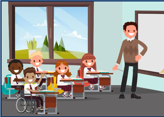
Today the school nurse is going to check how I'm growing and staying healthy.