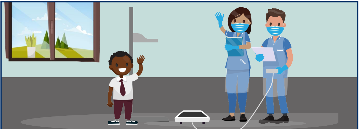
The nurse writes it all down and that's it, back to class now!