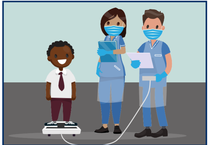
I stand on a little platform that tells the nurse how much I weigh.