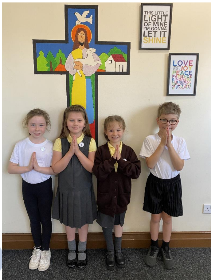
School Chaplaincy Team 2021

We are really excited to be able to introduce you to our wonderful new Chaplains and Mini Vinnies who are going to be instrumental in supporting collective worship and the Catholic life of our school. Look out for our Mini Vinnies next week helping out at the Macmillan Coffee Morning.