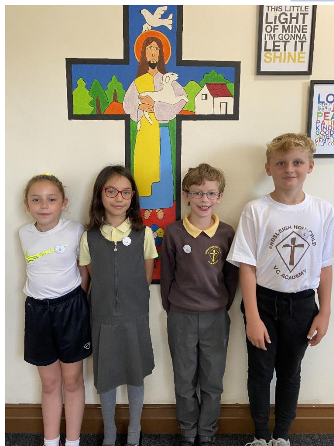
Mini Vinnies 2021